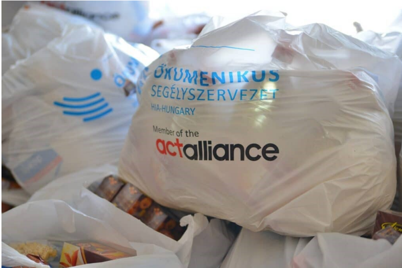
Relief supplies.

On February 24, the Russian military attacked Ukraine. Hundreds of thousands of persons have already sought refuge outside of Ukraine. Others have remained in the country but are displaced from their homes. The humanitarian crisis is accelerating in Ukraine and in neighboring countries as the violence escalates and the number of people on the move multiplies.