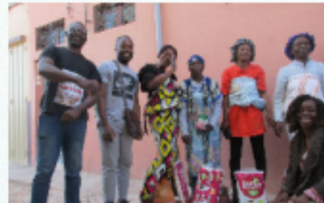
Migrant beneficiaries with the CEI team, near Agadir, Morocco