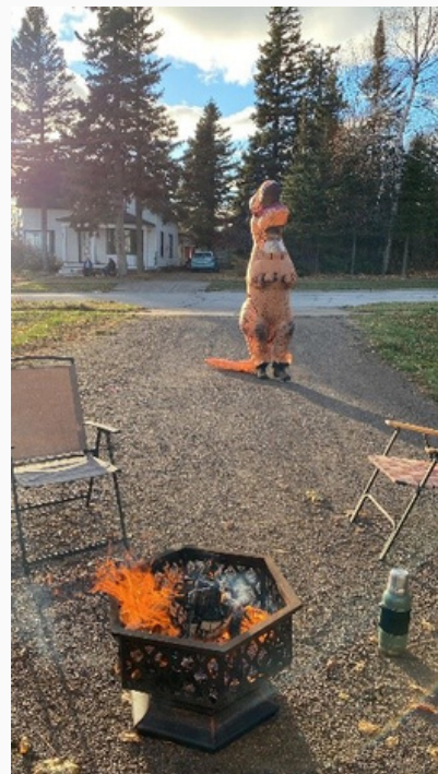
A T-rex visits the parsonage on Halloween