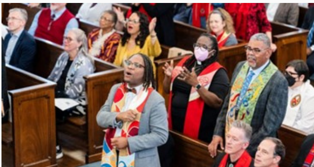
Attendees stand, clap and sing along with the music.